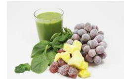
Fresh vegetable and fruit drinks