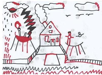
Drawing made by a typically developing 6-year-old kid